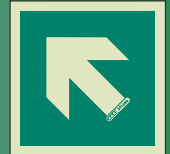
4870 C 4870 E, 4870 Q