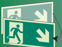
Double sided signs DSG: 150 x 300mm DSI: 200 x 400mm DSW: 250 x 500mm