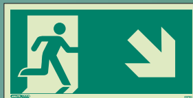
4979 G 4979 L, 4979 I, 4979 W