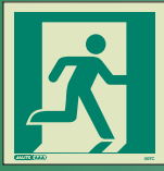
C: 150 x 150mm