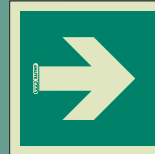
4860 C 4860 E, 4860 Q