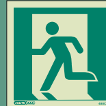
488 C 488 E, 488 Q