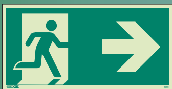
I: 200 x 400mm Maximum viewing distance: 30m