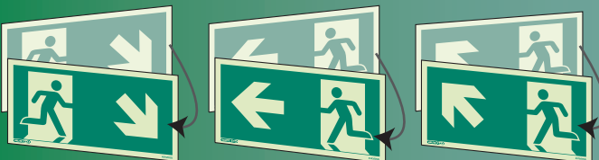
4979 DSG, 4979 DSI, 4979 DSW, 4343 DSG, 4343 DSI, 4343 DSW, 4978 DSG, 4978 DSI, 4978 DSW

Double-sided signs are designed to enable viewing from either direction.