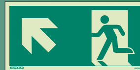
4978 G 4978 L, 4978 I, 4978 W