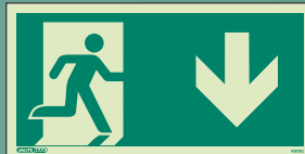
4975 G 4975 L, 4975 I, 4975 W