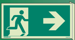
Wall mounted double sided signs FSG: 150 x 300mm FSI: 200 x 400mm