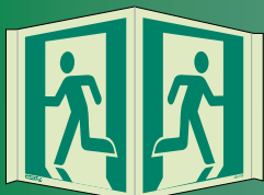
Panoramic sign P15: 150 x 150mm P20: 200 x 200mm