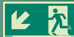
4980 G 4980 L, 4980 I, 4980 W