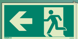
4343 FSG, 4343 FSI

JALITE AAA has excellent luminance performance and satisfies International Standards for photoluminescent requirements.