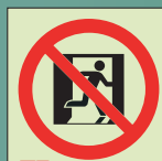
8247 C 8247 E

Site this sign on doors to clearly identify a non escape route.