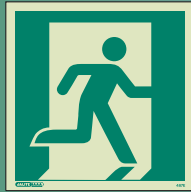
E: 200 x 200mm