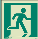
487 C 487 E, 487 Q