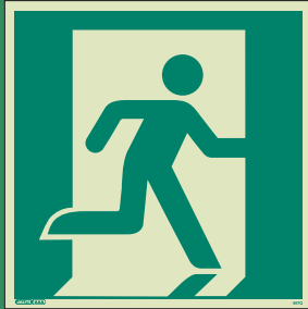
Q: 300 x 300mm